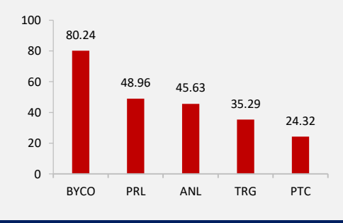
Top-5 Index Movers (Points)